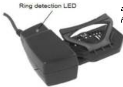
Surround microphone #1

Handset Lifter External Microphone Sensor Cord Adhesive Tape